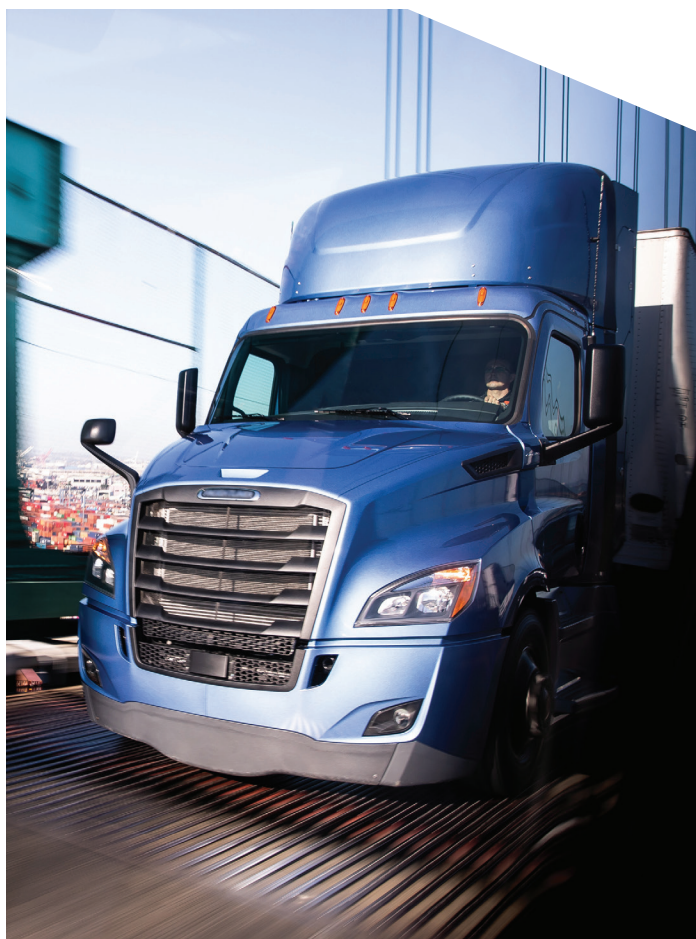
More than half of all natural gas dispensed in California for transportation is RNG, powering buses, refuse trucks and heavy-duty trucks.