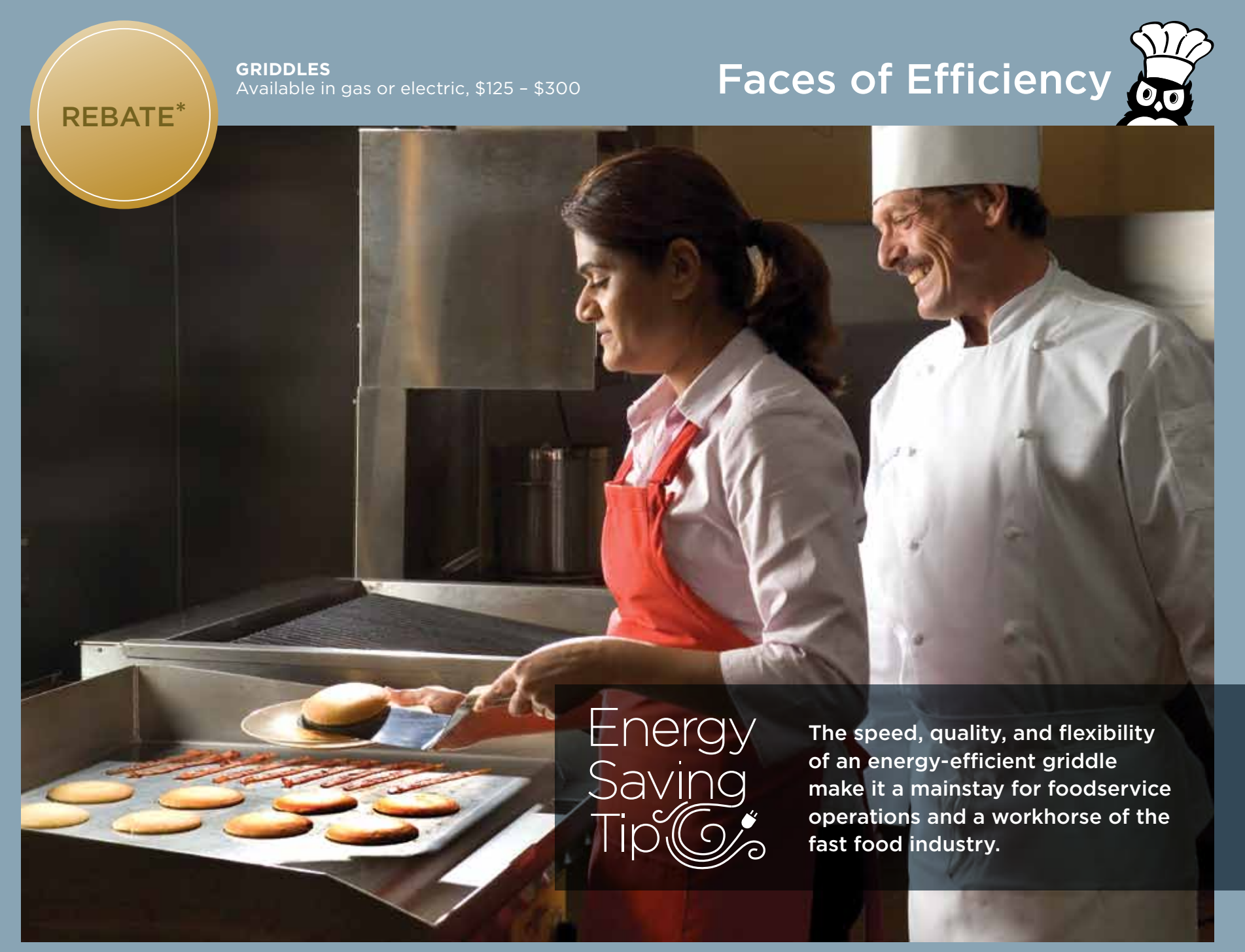
To register, visit: Southern California Gas Company socalgas.com/business | Pacific Gas & Electric fishnick.com Southern California Edison sce.com/energycenters | San Diego Gas & Electric sdge.com/foodservice