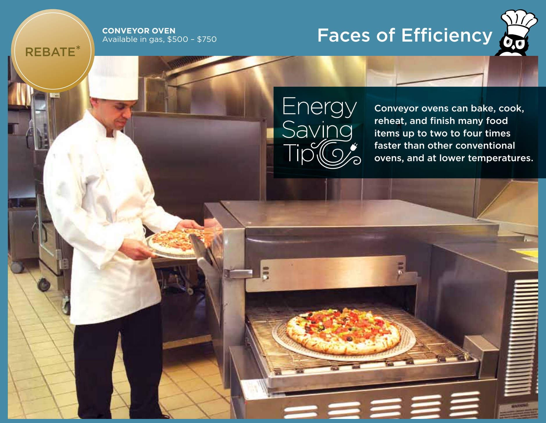
To register, visit: Southern California Gas Company socalgas.com/business | Pacific Gas & Electric fishnick.com Southern California Edison sce.com/energycenters | San Diego Gas & Electric sdge.com/foodservice