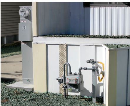
Adequate working space