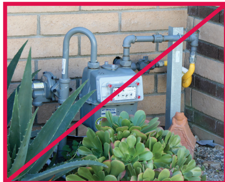
Inadequate working space