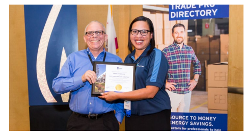
SoCalGas offers seminars on energy efficiency, natural gas technologies, certification programs, and more.

First quarter seminars are currently open for registration, and additional trainings are announced throughout the year. To learn more or to register for a class, visit seminars.socalgas.com